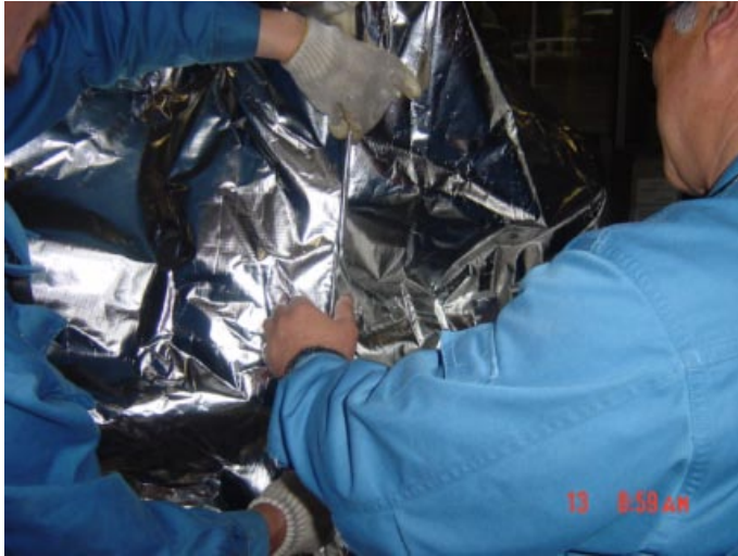
VACUUM WRAPPING WORKS STEP 1 : PUT APPROPRIATE DEHYDRATING MATERIALS WRAPPING BY PRESSURE-REDUCING METAL SHEET