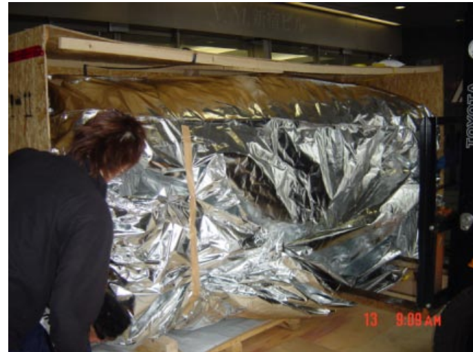
VACUUM WRAPPING WORKS EFFECTIVE FOR : - PRECISION MACHINERY & INSTRUMENTS - RETURN EXHIBITION GOODS THE MATERIAL CAN BE RE-USED SEVERAL TIMES