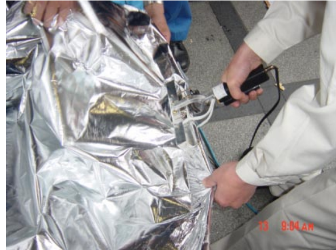
VACUUM WRAPPING WORKS STEP 2 : USING ELECTRICAL SEALER